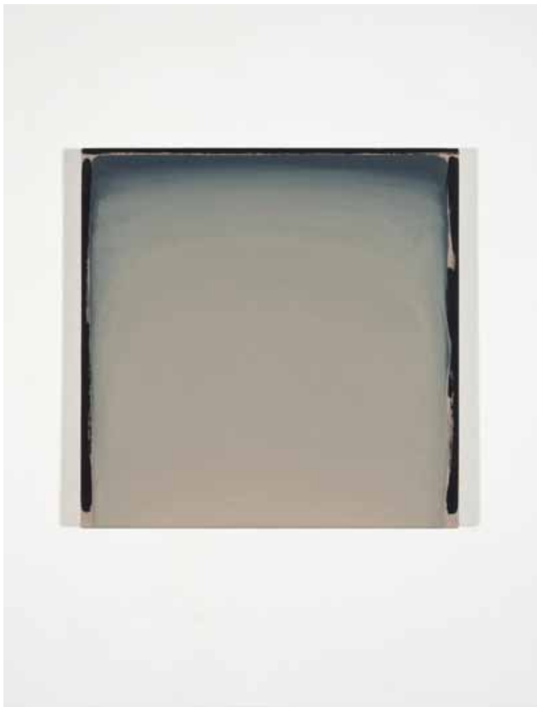
'Whitby' Kerlin Gallery, Dublin, 2010