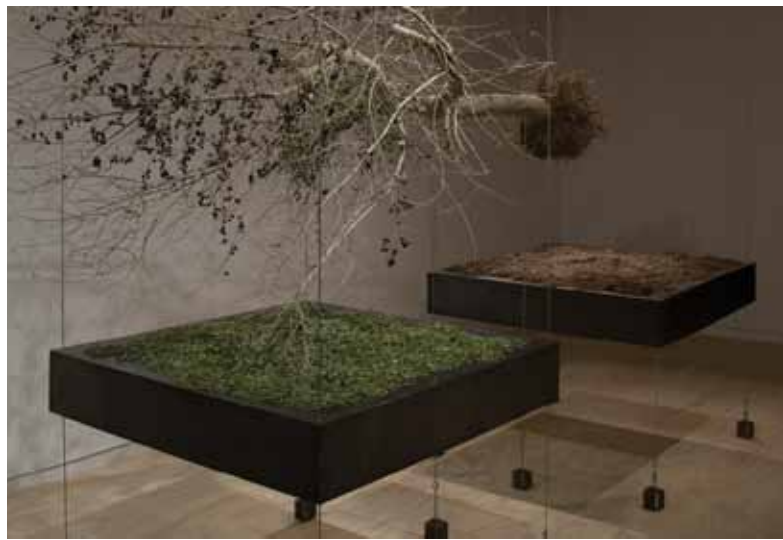
Above & Opposite Downfall 2009 olive tree, slate, powder in resin, fbre glass, soil, steel, cable, rigging components, 265x121x410cm, copyright Sichhan Hapaska, courtesy Kerlin Gallery