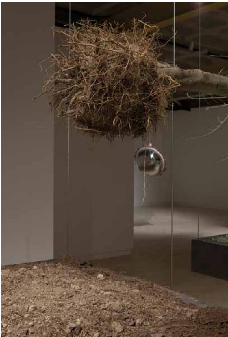
Above Downfall 2009